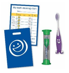
Dental goody bag