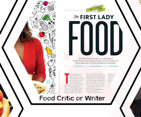
Food Critic or Writer